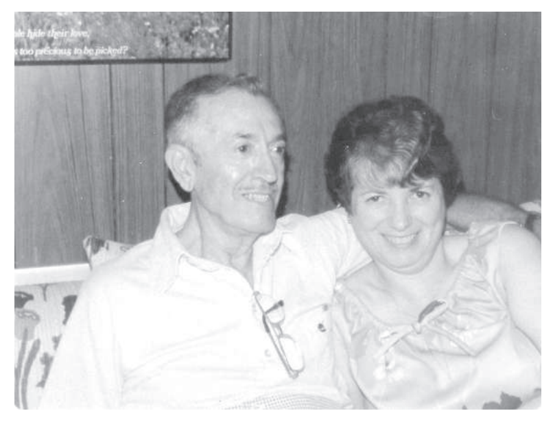
HAPPY TO BE BACK IN FLORIDA

We were back home and it was July when the bonds that the lawyer had been holding for us, matured. I wrote to him and received no answer. Finally he sent a note with some excuse that he could not legally cash the bonds and that he would have to re-invest them for us. He asked for a fee to do that. At that point I remembered my dream of the snake with the molars. This man was looking for ways to take a bite out of our money. He had told us at first that it would take about two years to close our case, but because we had done all the leg work, it had taken a little less than six weeks. He had not made the money he wanted to make on us. So now he was looking for ways to make a little more. We realized that this had turned into spiritual warfare.